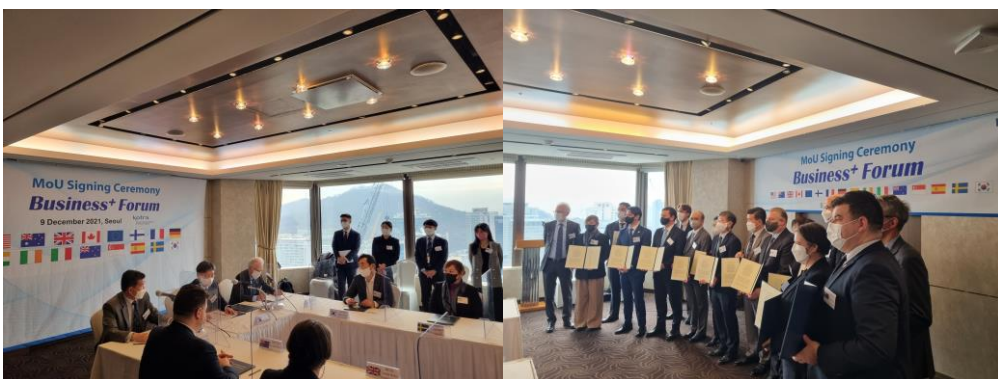
MoU Signing Ceremony with 15 chambers for the KOTRA Business+ Forum on the 9th of December at the Lotte Hotel, Astor Suite.