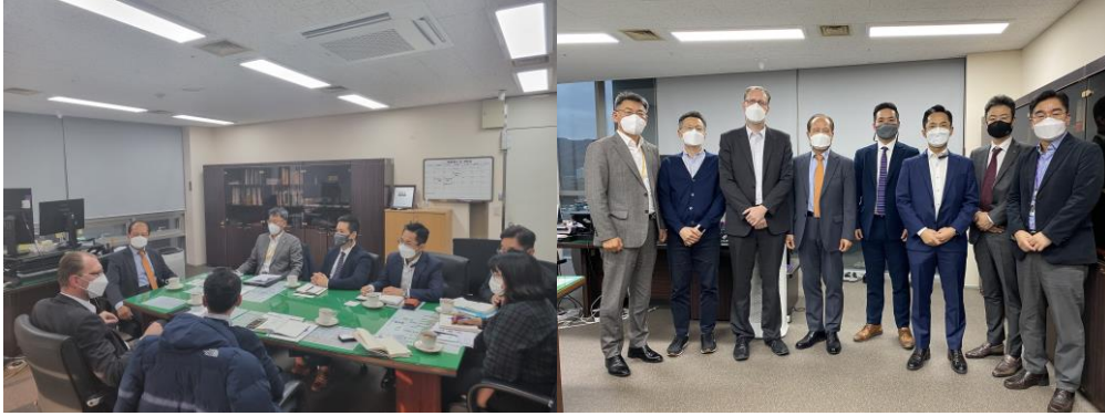
Round Table Conference with KOTRA Foreign Investment OMBUDSMAN on the 10th of November: IKEA, Volvo Trucks, and KRAFT POWERCON actively appealed to the issues of deregulation and fair open market competition.