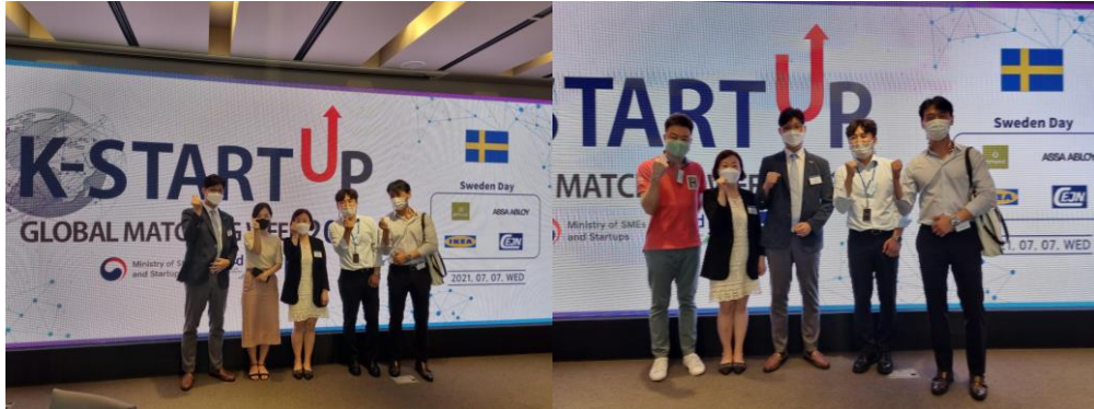
K-START UP GLOBAL MATCHING WEEK 2021. Sweden Day sponsored by the Ministry of SMEs and Startups / July 7: CEJN, ENVAC, ASSA ABLOY, and IKEA Korea participated in.