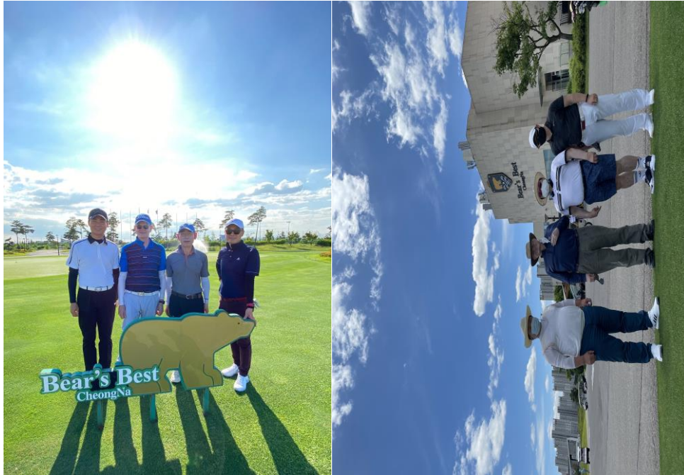
The 8th SCK-FINNCHAM MASTERS GOLF EVENT on the 16th of June. Bear's Best CheongNa