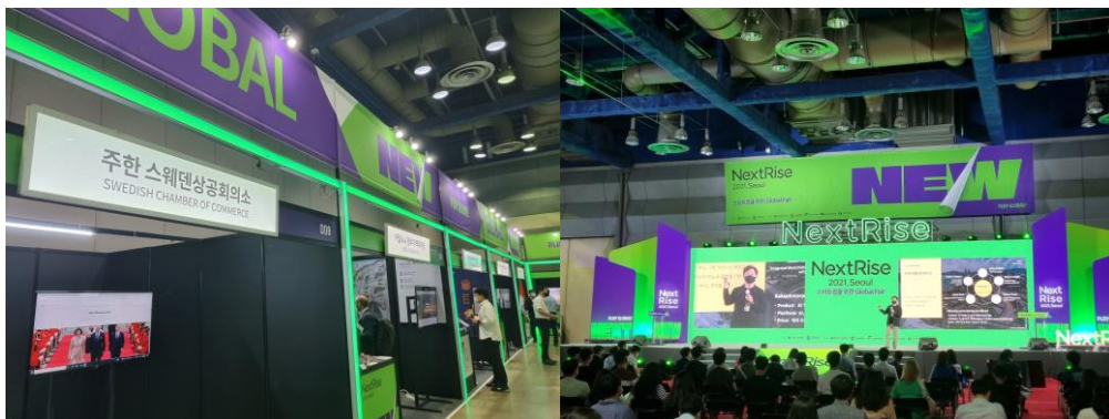
NextRise 2021, Seoul. Start-Up Global Fair. COEX on the 28th and 29th of JUNE. SCK met up with 38 Korean Start-Up related stakeholders during the fair.